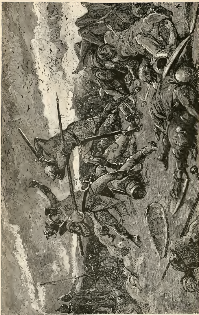
The Combat of Mordred and King Arthur.